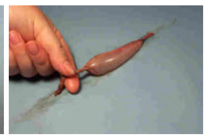
9. Twist the bladder to lightly seal the opening.