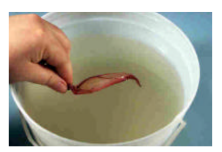
10. Float in water to demonstrate buoyancy.