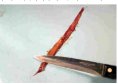
5. Make a clean cut at the vent end of the swim bladder.