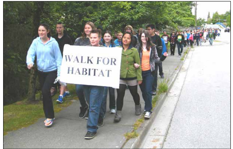
The Walk for Habitat sends a message to Maple Ridge: be as environmentally aware and proactive as your young people!

An event of note is the annual Walk for Habitat, when over 150 sign-carrying students and staff take