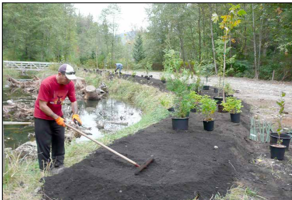
The gravel stockpile, rocks, and roots at Oxbow Pond were removed. Then 25 metres of topsoil were imported and planted with shrubs and trees to help stabilize the bank and provide shade.

The FWCP is a partnership between Fisheries and Oceans Canada, BC Hydro, the Province of B.C., First Nations, and the public to conserve and enhance fish and wildlife impacted by the construction of BC Hydro dams.