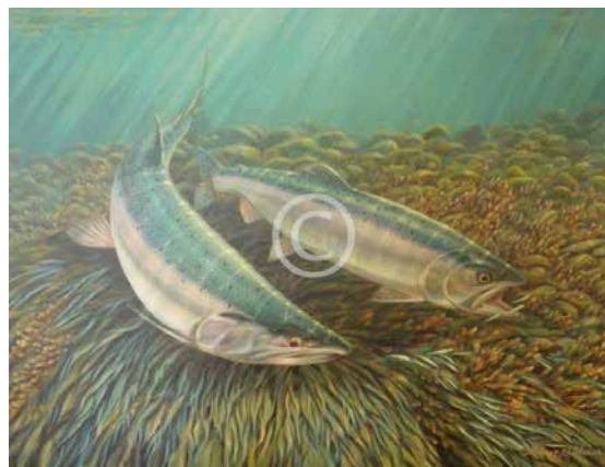
Nile Pinks by Bruce Muir is just one of the exquisite works featured on the new website as a fundraiser.

NCES members value thriving ecosystems in local streams, as well as the marine environment of the Strait of Georgia and the Salish Sea. They operate a hatchery for pink salmon. Other projects include bull kelp forest restoration, eelgrass mapping and monitoring, and public education.