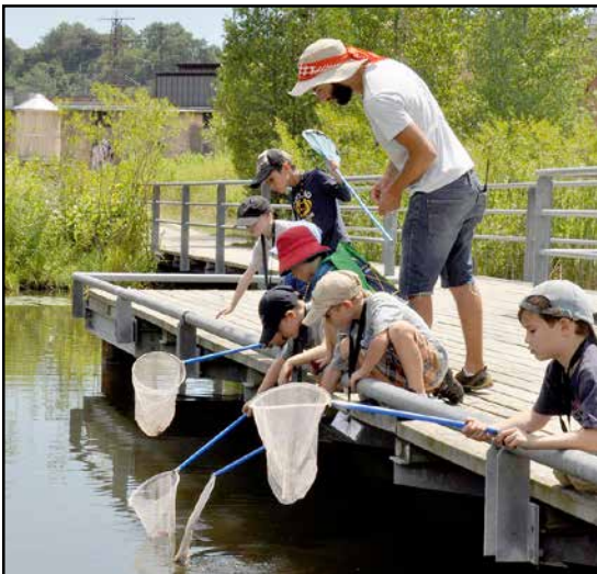
"Hey, what's THAT?"

For more information about the RBC-Evergreen Watershed Champions Award or to access lessons and webinars, visit evergreen.ca/watershed .