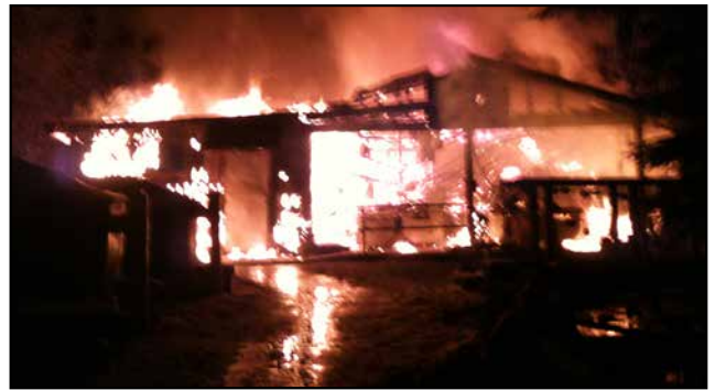
The hatchery was totally destroyed. At the moment, headquarters is a construction trailer delivered to the site by the City of Port Moody.

Though the hatchery is gone, the memories gathered over the past 36 years remain and this group will rebuild. Since the fire, volunteers have been working on plans and designs for a new building. You can follow their progress at the hatchery website .