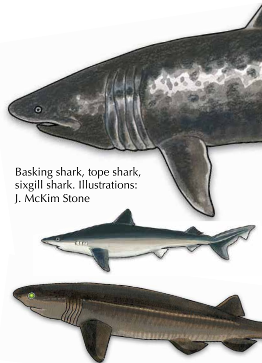
Basking shark, tope shark, sixgill shark. Illustrations: J. McKim Stone

DFO is collecting data on sharks, especially the basking shark (listed as “endangered” under the Species at Risk Act ), and the bluntnose sixgill shark and tope shark (species of “special concern”). Report using the online form , or call toll-free: 1-877-50-SHARK (1-877-507-4275).